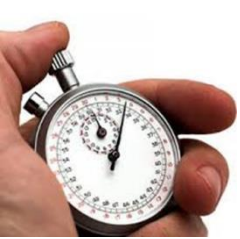
Tabla de fechas (III)